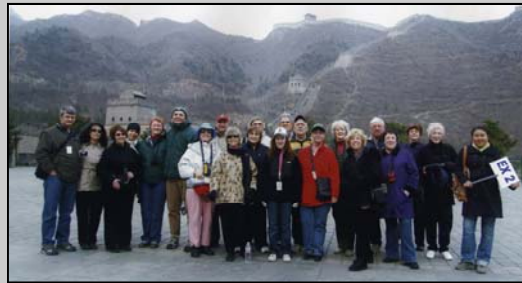
2008 Exeter Area Chamber of Commerce Tour Group 2 at the Great Wall in China.